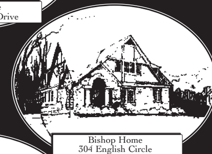
Bishop Home 304 English Circle