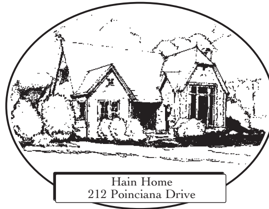
Hain Home 212 Poinciana Drive