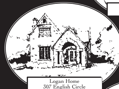
Logan Home 307 English Circle