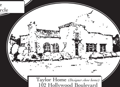
Taylor Home (Designer show home) 102 Hollywood Boulevard

Ticket Outlets: Harmony Landing / Hunter Cleaners Urban Cookhouse / Sweet Peas Garden Center