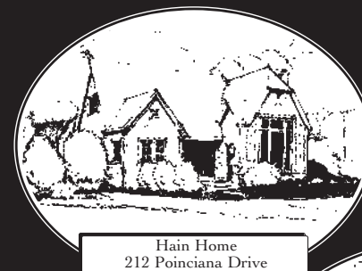
Hain Home 212 Poinciana Drive